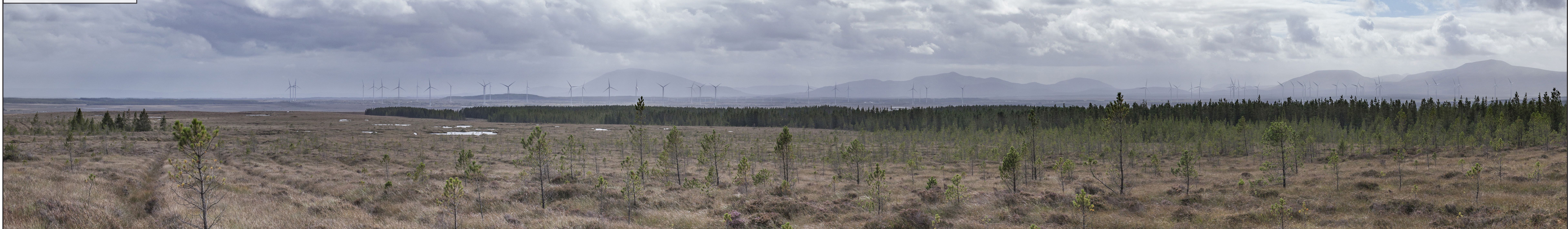
Extent of 53.5° planar panorama