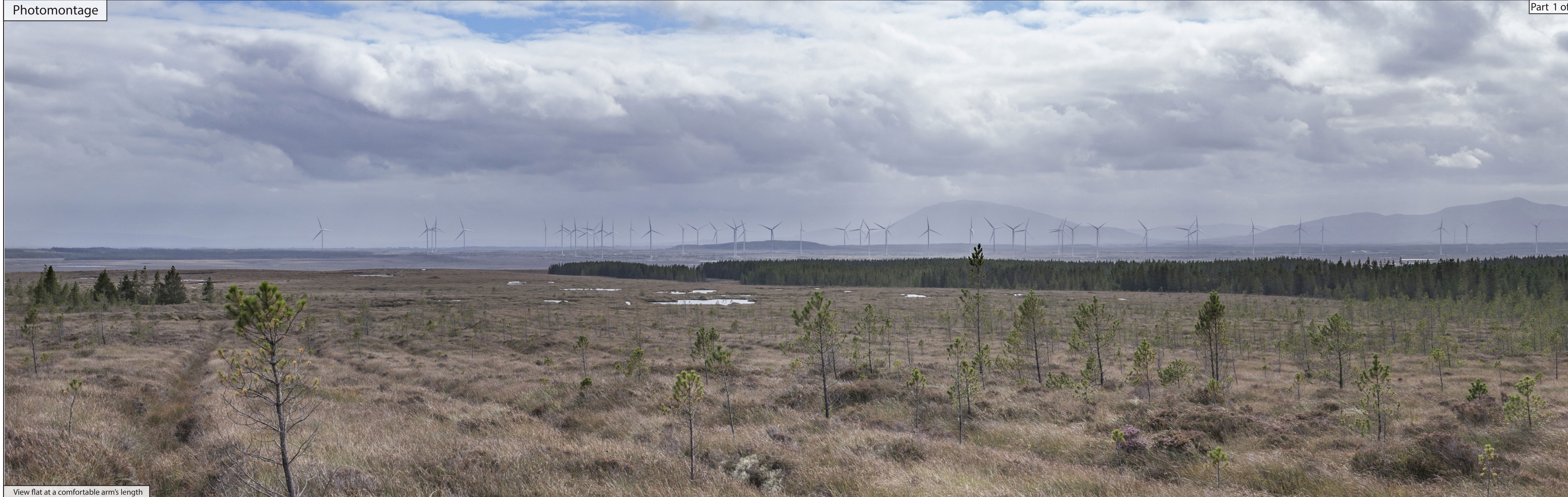
View flat at a comfortable arm's length

This planar projection panorama has been captured, prepared and presented in accordance with the guidance set out in the Scottish Natural Heritage 2017 guidance 'Visual Representation of Wind Farms'.